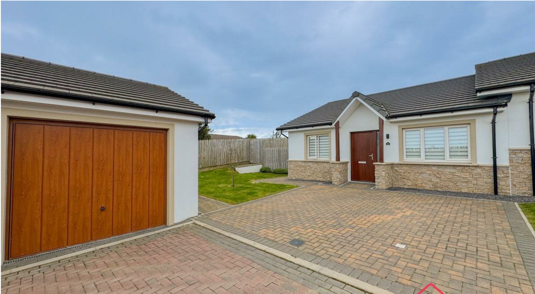
20 Mylchreest Drive, Reayrt Mie, Ballasalla, Isle of Man, IM9 2BB Asking Price £395,000